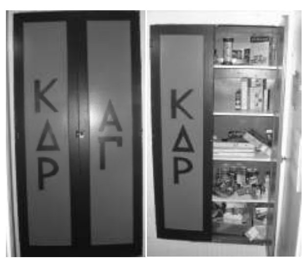
New 1st Floor pantry

There have been many improvements going on at the Kappa Delta Rho house this year. The house was thoroughly cleaned at the beginning of the year. The spring-cleaning involved painting the second floor kitchen, the second floor stairwell, and the basement walls. Shelving was added to the second floor kitchen and the laundry room to allow for more organization. A lot of the big improvements took place in the basement. The floor was cleaned and then painted with a sealant and a new sound system was purchased for the basement. The sound system included two new JBL Speakers, a new QSC amplifier, and a crossover. With the new system, the sound quality in the basement is excellent. The attic was organized again and the archives were organized as well. On the first floor a pantry (right) was added on the stair well between the first floor and the basement. Also the kitchen and the trim on the entire floor were painted over the summer. Furthermore, all the cabinets on the first floor have been cleaned out providing lots of new storage that was originally full of clutter and garbage. The deck in the backyard has additionally been stained on both the first and second floor. The house is continually being improved and is looking better everyday.